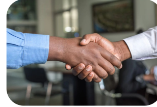
Generation Z Recruitment, Retention