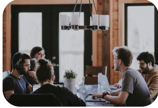
Employee Resource Group Strategy