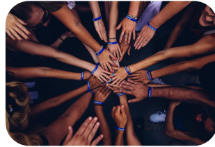
Culture and Change Management