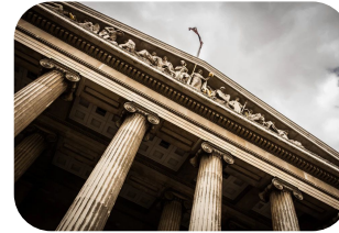
Inclusive Policy and Compliance