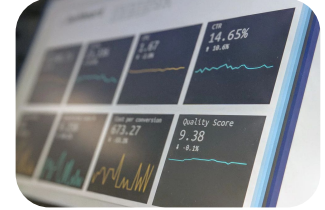
Analytics and Self-ID Solutions