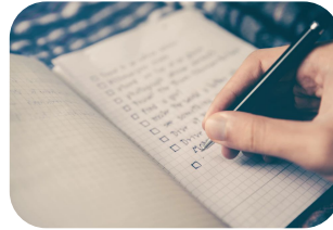
Transgender Workplace Inclusion