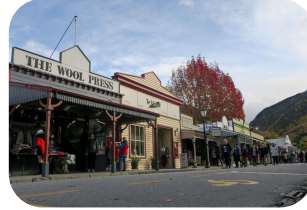
Implementation Outside Major Cities